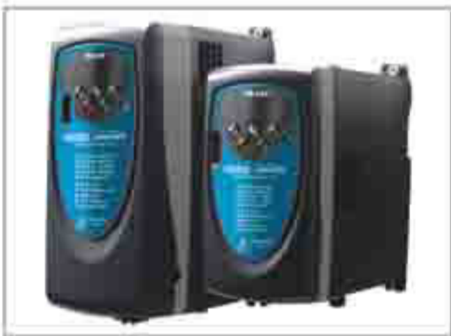
A.C. Inverter Drive