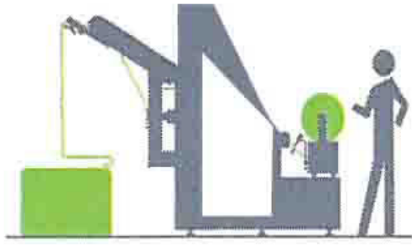
Fold to Lap / Roll