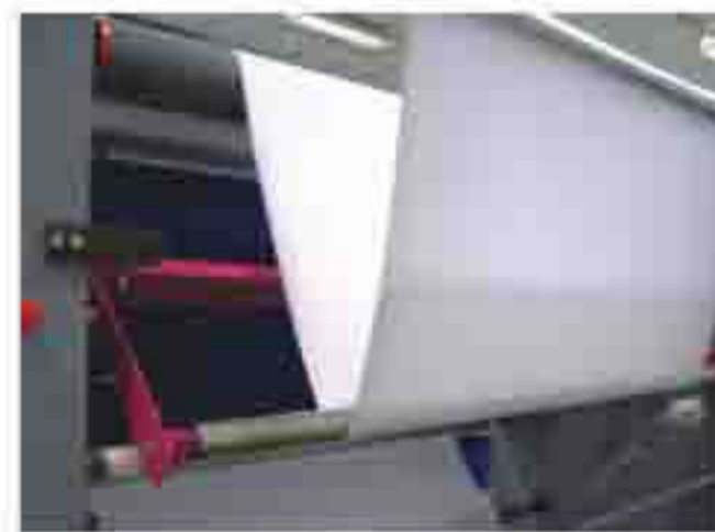
Dancing Roller Mechanism