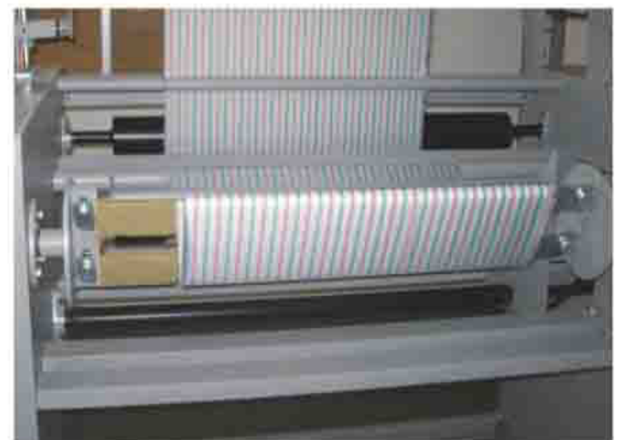
Lapping on Strawboard

BFM can be supplied with highly accurate electronic length counter meter with presets. It stops the machine automatically at desired length meters for cutting and packing.