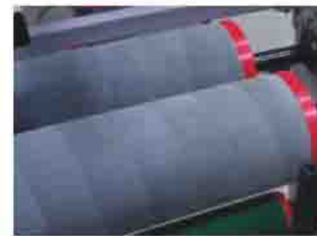
For Rolling - Winding Rollers