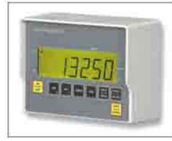
Electronic Weighing Meter