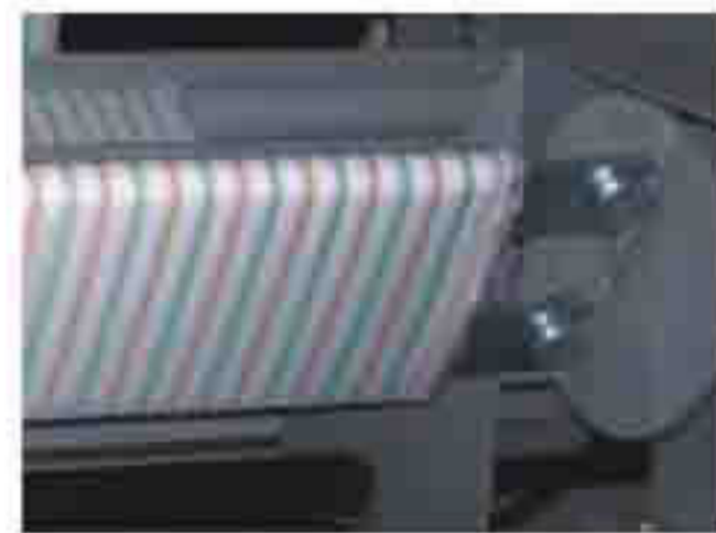
For Lapping - Lapping Flats