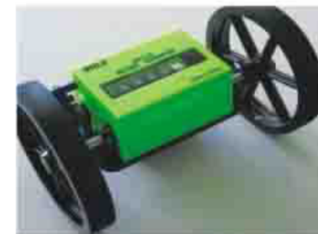
Mechanical Length Counter