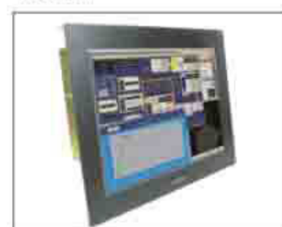
PLC and Data Logging System