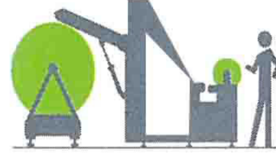
Batch to Lap / Roll