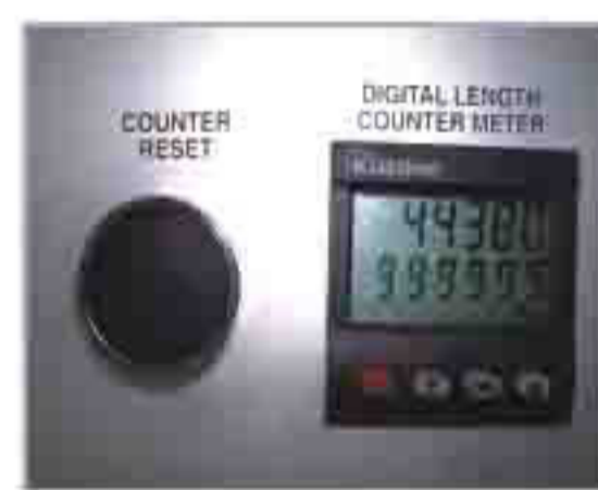
Electronic Length Counter Meter